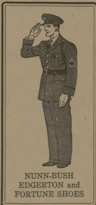
NUNN-BUSH EDGERTON and FORTUNE SHOES

Airman Zelan Jackets . . . Catalina Sweaters Reg. Socks . . . Reg. Ties