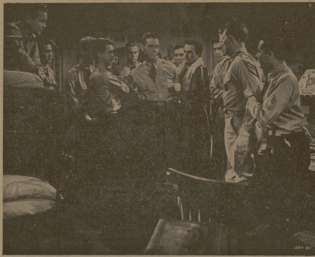
AT PREVIEW—A scene from "We've Never Been Licked" which will be shown publicly for the first time in Texas Friday night. The Aggie Corps will, as was greed upon at the beginning, see the picture before its release to the public, in Guion Hall Friday, immediately after mess.

Announcement will be made shortly of the fall and winter Town