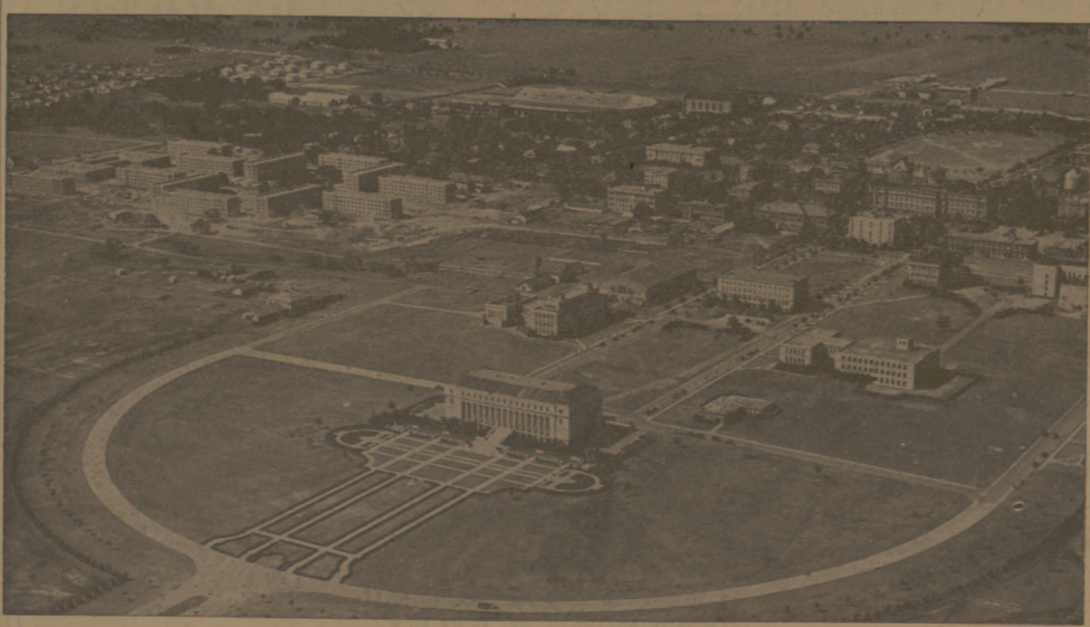
This picture of A. & M. includes the greater portion of the 4,000 acre Campus. In the back ground can be seen Kyle Field, which has a seating capacity of 40,000, and the old entrance that leads to the front of Academic Building. The Administration building is the first building in the foreground.