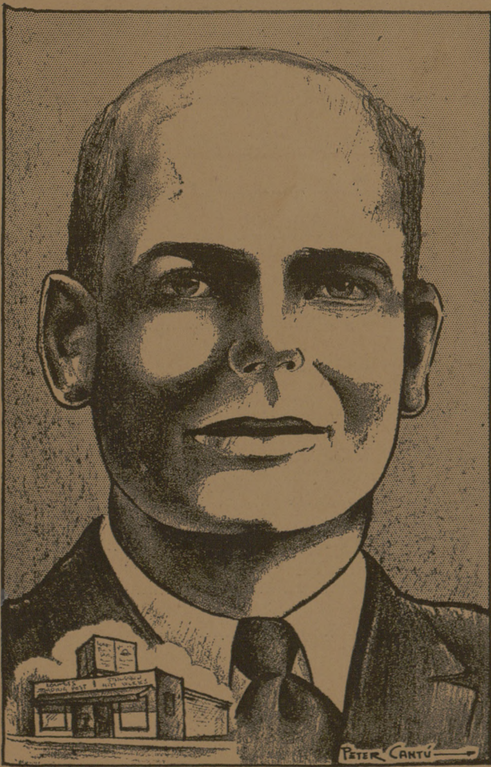
LOUPOT an aggie tradition

Lou Urges You to Come Early-- It Can't Last Long