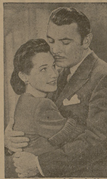
George Brent and Brenda Marshall in a scene from "You Can't Escape Forever" showing today and Friday at Guion Hall.