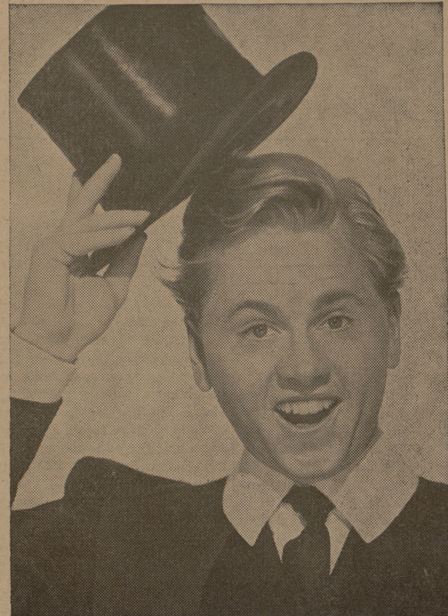
"A YANK AT ETON"—Another triumph for Micky Rooney. Coming to the Palace Theatre Thursday, Dec. 3; also showing Friday and Saturday.

fantry, 3; and Machine Gun Cavalry. It will be recalled that C Infantry is the outfit team whose Class baseball team pulled from behind to win the championship last semester.