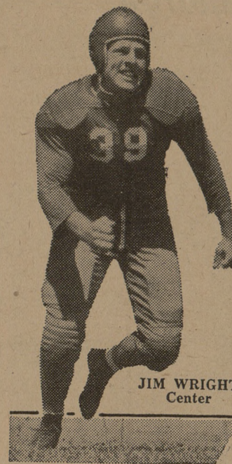
JIM WRIGHT Center