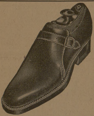
MANSFIELDS In a Military Manner

An average tire contains as much rubber as 55 goggles for the Army Air Corps.