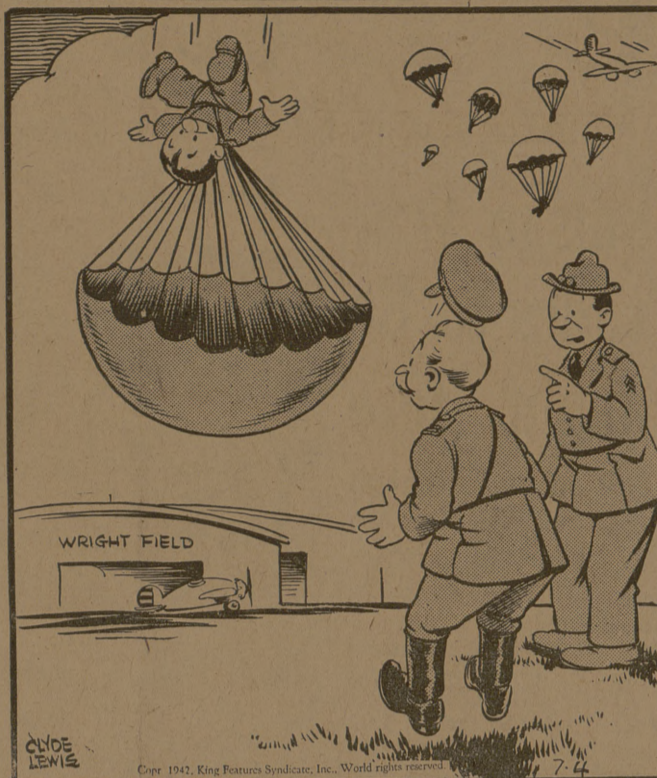
"Guess we'll have to put some lead in Buck's shoes, Captain. The 'chute weighs more than he does!"