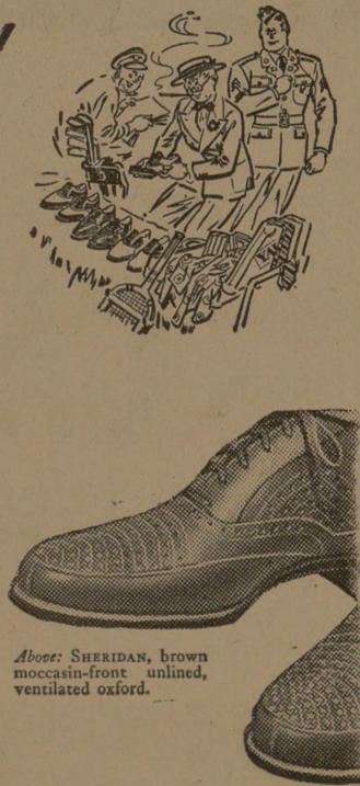
Above: SHERIDAN, brown moccasin-front unlined, ventilated oxford.