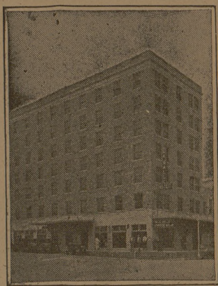
Company or group banquets up to 100 persons