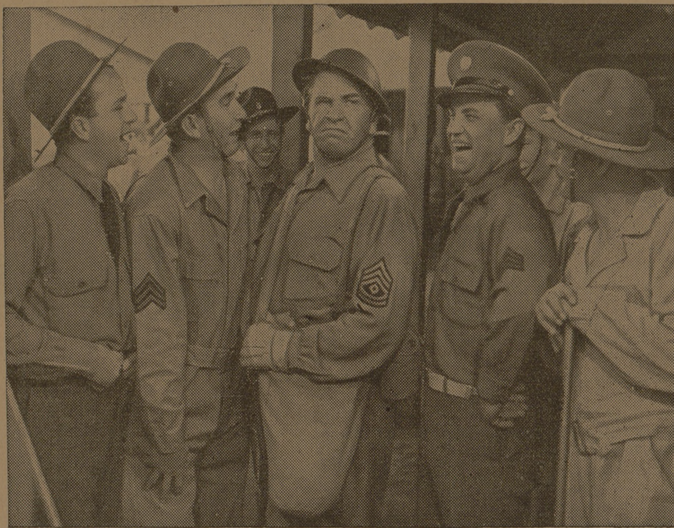
It's a tough battle for old timer Wallace Beery to get accustomed to the technique of modern warfare and the mechanized cavalry, but it's one which provides top flight entertainment. The picture opens at Guion Hall Saturday.