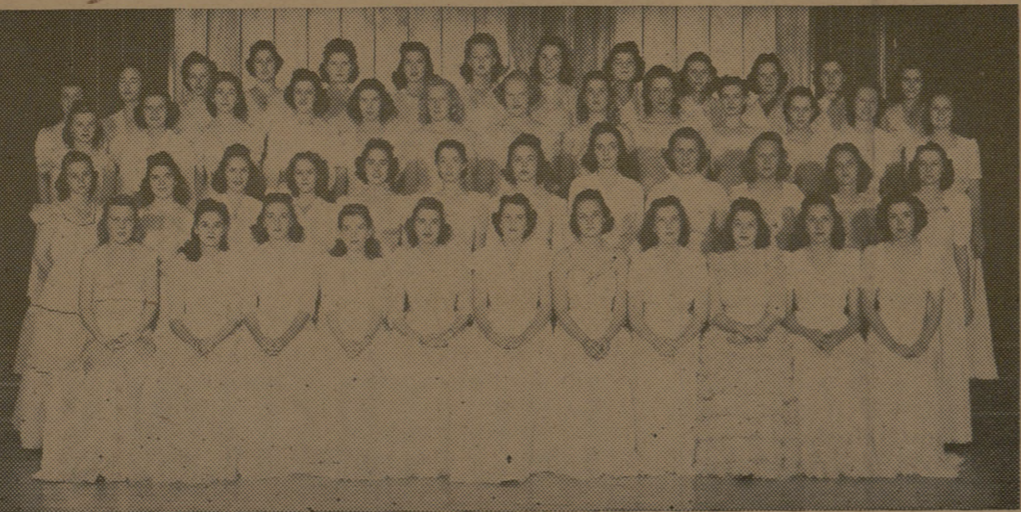
Texas University Girls' Glee Club