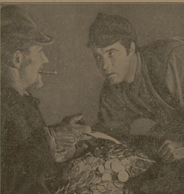
The poor England farmer, James Craig, right above, listens while the devil, Walter Huston, makes a bargain with him to sell his soul for seven years of prosperity, in a scene from "All That Money Can Buy" at the Campus today and tomorrow. It is a double-featured with "Juke Box Jennie."