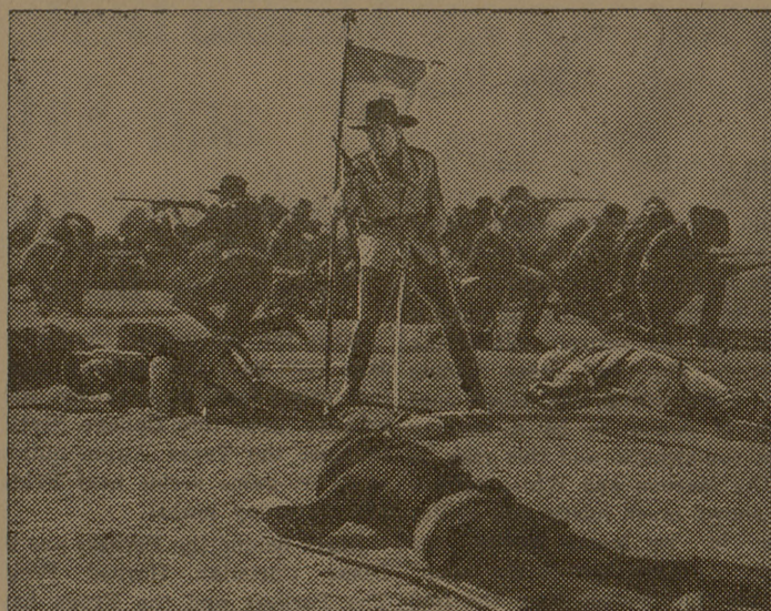
Errol Flynn, Olivia deHavilland, and Alan Hale are starred in "THEY DIED WITH THEIR BOOTS ON," the story of General Custer's life which will be shown at Guion Hall, Thursday and Friday, February 12 and 13.