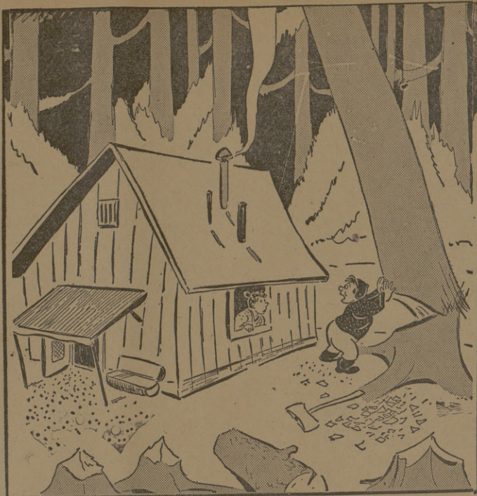
"All right, Ma. Where do you want this kindling?"

FOR A ROUND TRIP RIDE to Amarillo for the Thanksgiving holidays (leaving after game) inquire at Room 12, Y.M.C.A.