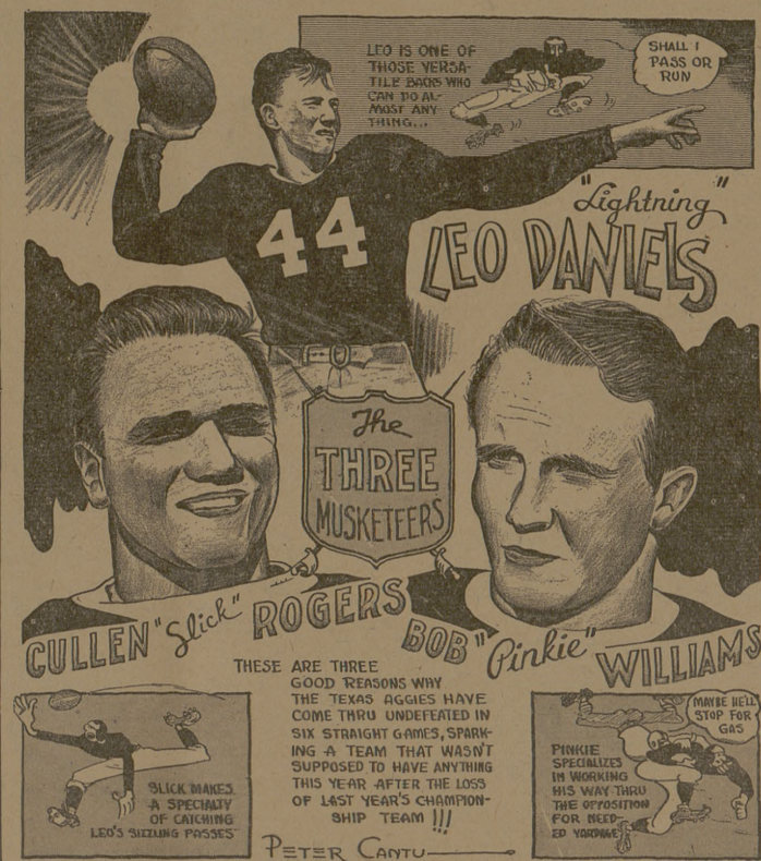
"TOUCHDOWN 'THREESOME' by Pete"