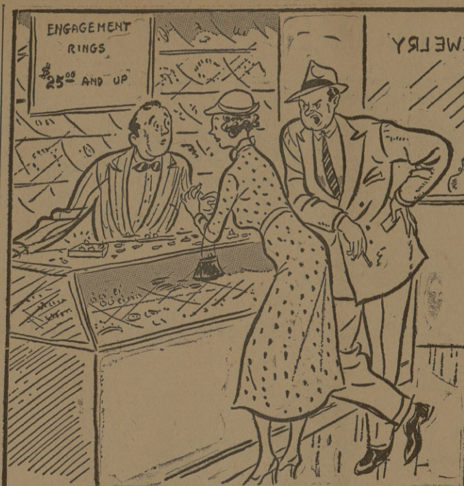
"Hurry and make up your mind before I change mine!"

Full information as to the requirements for these examinations, and application forms, may be obtained from College Station or Bryan Secretary of the Board of U. S. Civil Service Examiners, at the post office or customhouse in Bryan, or from the Secretary of the Board of U. S. Civil Service Examiners, at any first- or second-class post office.