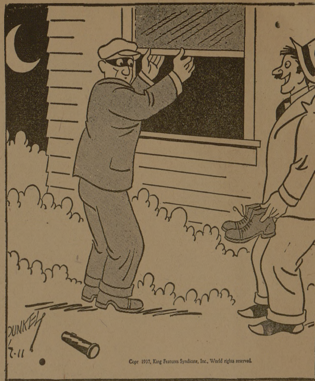
—and I've been trying to get that window open all summer!