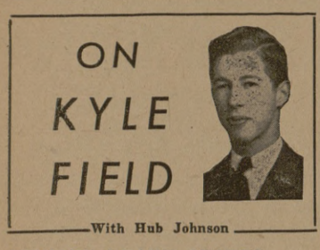
SENIORS LEAVE SPORTS PICTURE TO UNDERCLASSES

Sitting at the table last night awaiting our turn in line to pass through the ring and thus step another pace toward that final end, for the first time we realized just how many places must be filled in the sports lineup here at Aggieland next year by the present members of the upperclasses.