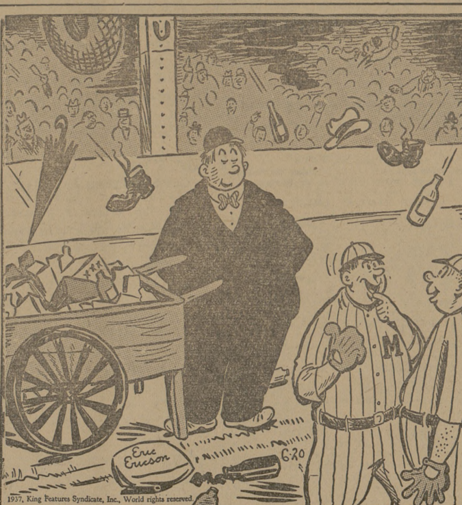
"The umpire also runs a junk-yard!"