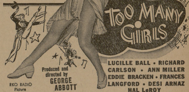
LUCILLE BALL • RICHARD CARLSON • ANN MILLER EDDIE BRACKEN • FRANCES LANGFORD • DESI ARNAZ HAL LEROY

From the Long-Run B'way Musical Comedy Sensation!