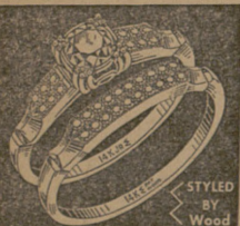
Diamond ring. One large center diamond. 12 diamonds in mounting. Wedding ring to match. 20 diamonds set in double row.

ALWAYS QUALITY VALUES IN DISTINGUISHED WEDDING AND ENGAGEMENT RINGS!