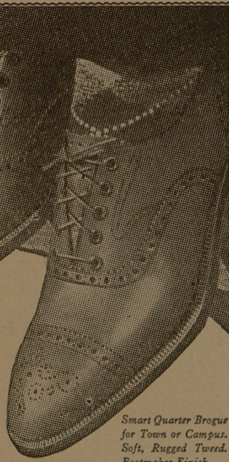
Smart Quarter Brogue for Town or Campus. Soft, Rugged Tread. Bootmaker Finish... Leather Sole.