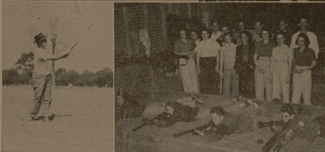
Above are shown a few scenes from A. & M.'s first Minor Sports Festival, which was held here last weekend. It proved a great success, and helped further the proper recognition of minor sports.