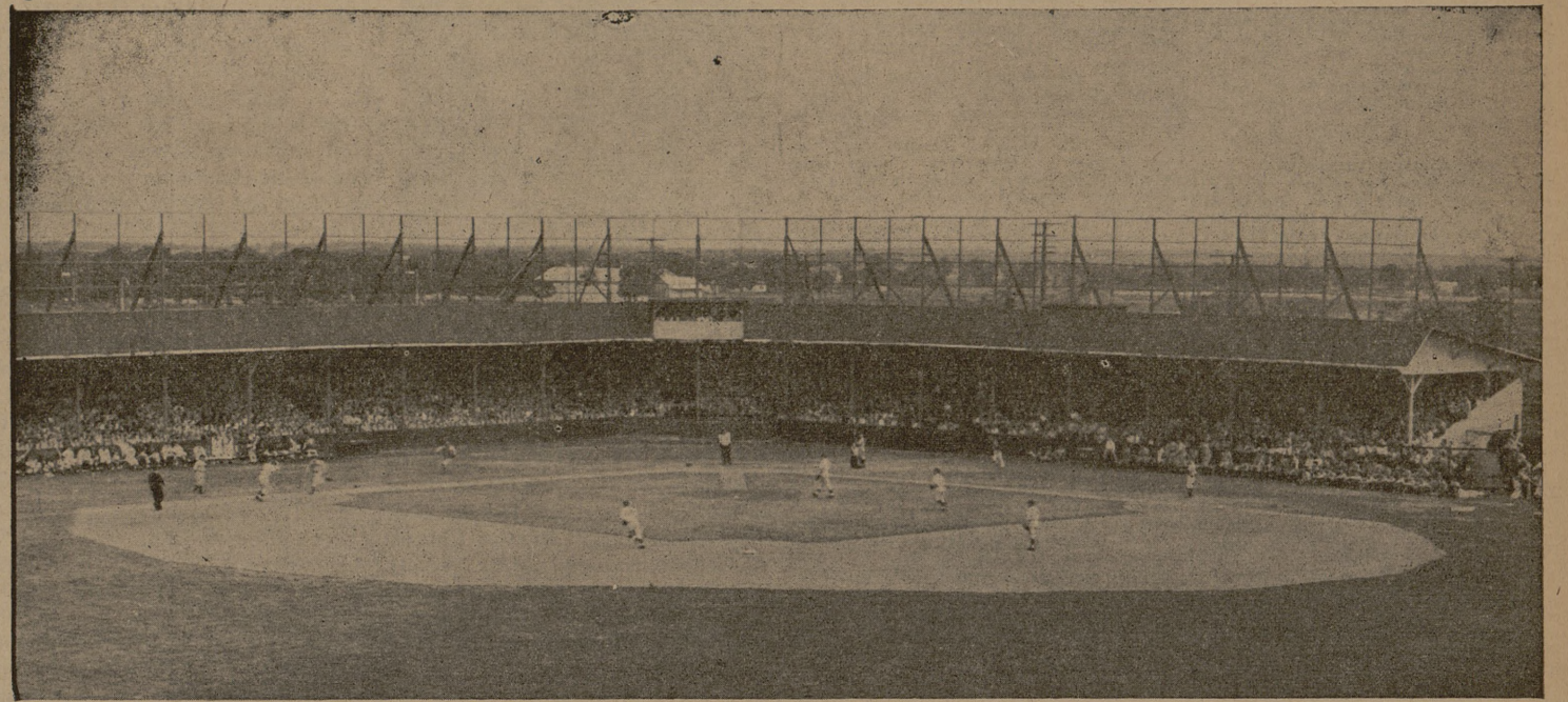
Kyle Field baseball diamond, where the umpire today at 1:00 p. m. will yell "Play ball!" to start off A. & M.'s fourth annual Sports Day.