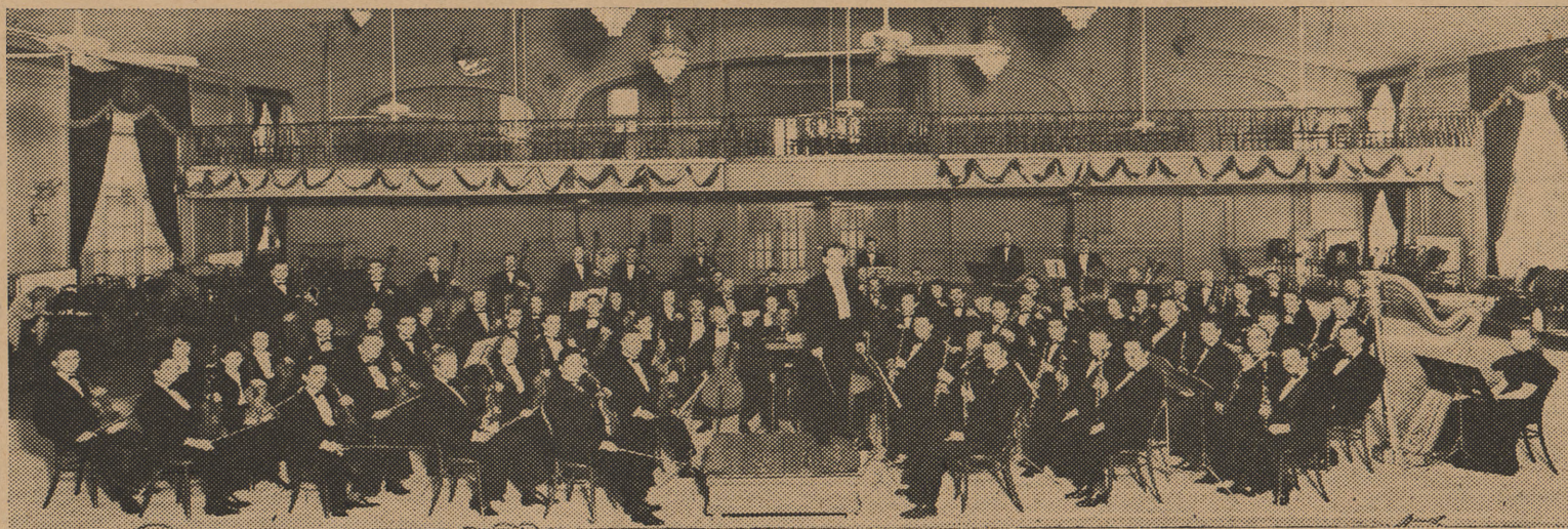
The Houston Symphony Orchestra, famed in musical circles, will present a concert of the most popular semiclassical selections on the A. & M. Town Hall here next Tuesday night. This will be the second appearance of the orchestra at Aggieland, where it was greeted enthusiastically by the Aggies last year.