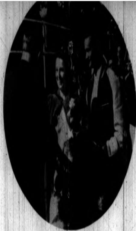
Above: At the Arkansas University homecoming when the Aggies beat the Razorbacks. The governor of Arkansas greets the homecoming king and queen on their field.