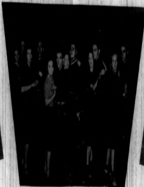
T. S. C. W. A. & M. ivy dance at Denton.