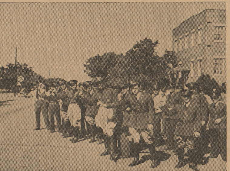
A. & M. students leave by all methods just preceding football games but by far the most popular is the "thumb" method. Above are shown an aggregation of Aggies leaving for Fort Worth for the first Aggie corps trip of the season.