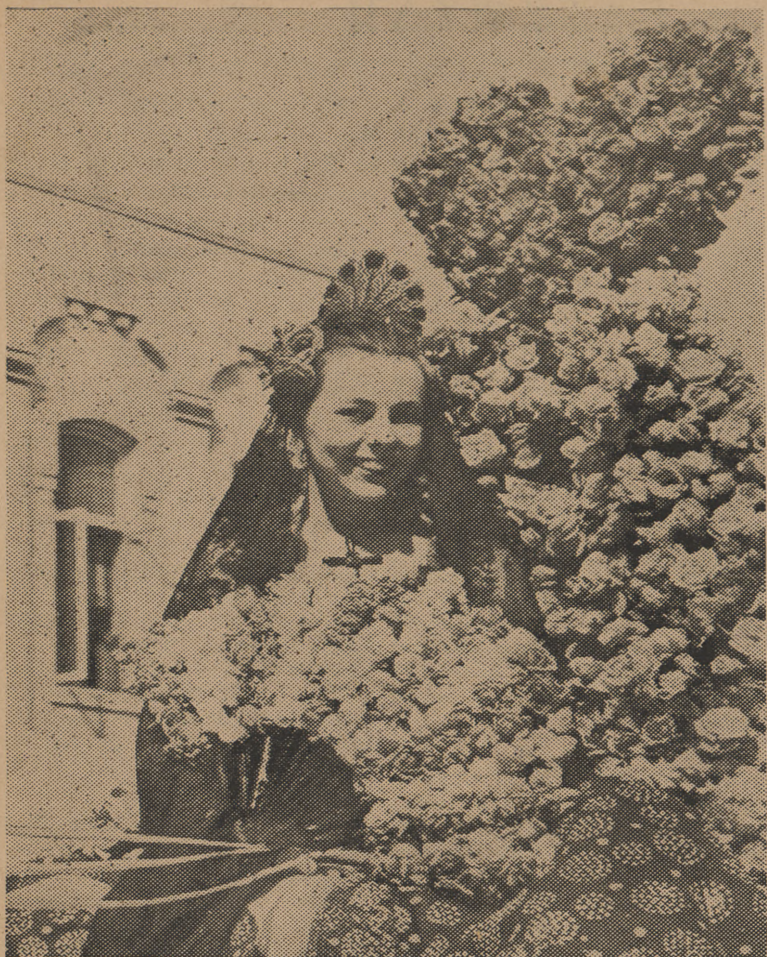
The comely lady above, depicted as a Spanish senorita in the midst of Tyler roses, was one reason for Aggies enjoying the Tyler Rose Festival last Saturday.