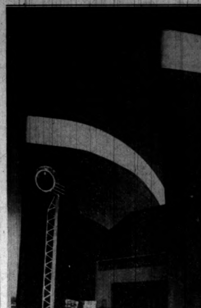
Marine Transportation building at the World's Fair. Twin grows rise 80 feet, 30 feet higher than bow of Nermandie .