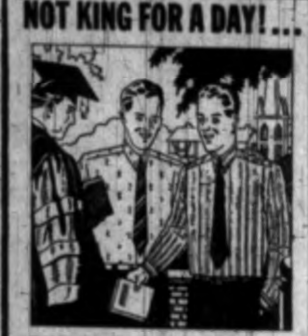
UT FOR A WHOLE YEAR