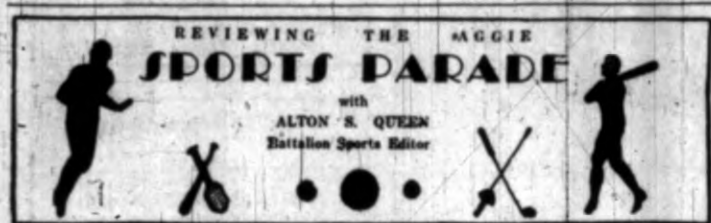
COACHES DEVELOP NEW MATERIAL