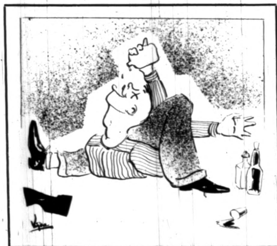
The contortionist who went on a bender.