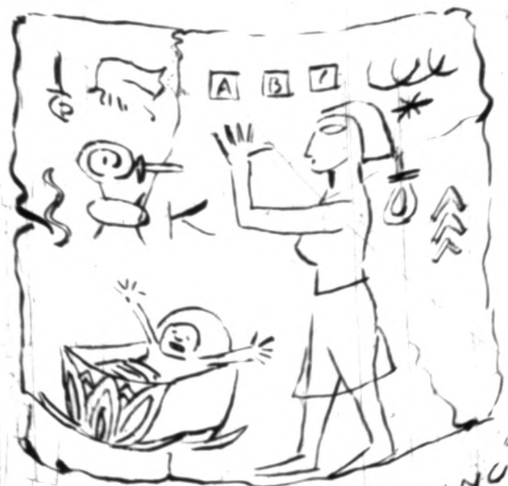
SO WE SEE "CRIBBING" IS QUITE AN OLD SPORT!! WHATT A RELIEF!!

"I like mathematics when it isn't over my head." "That's the way I feel about pigeons." —Punch Bowi