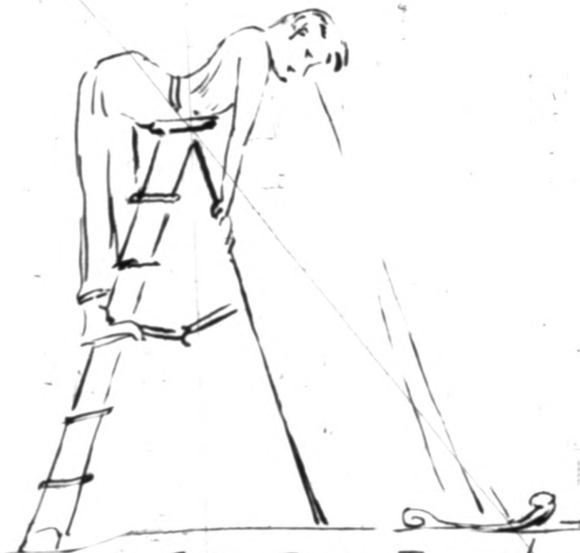
THE FINAL TEST!