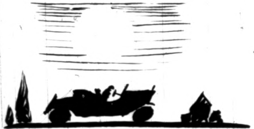
BURNING THE MID- NITE OIL!!

Heard in Bio: My next lecture may prove em- barrassing to you young men and women. Any who wish to may stay away.