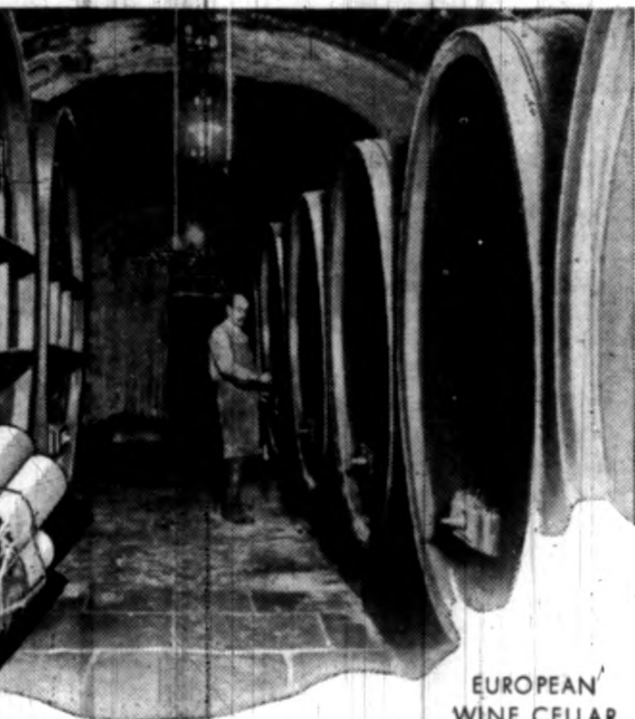
EUROPEAN WINE CELLAR

S OMETHING like the method of ageing fine wines is used in ageing and mellowing the tobaccos for Chesterfield cigarettes.