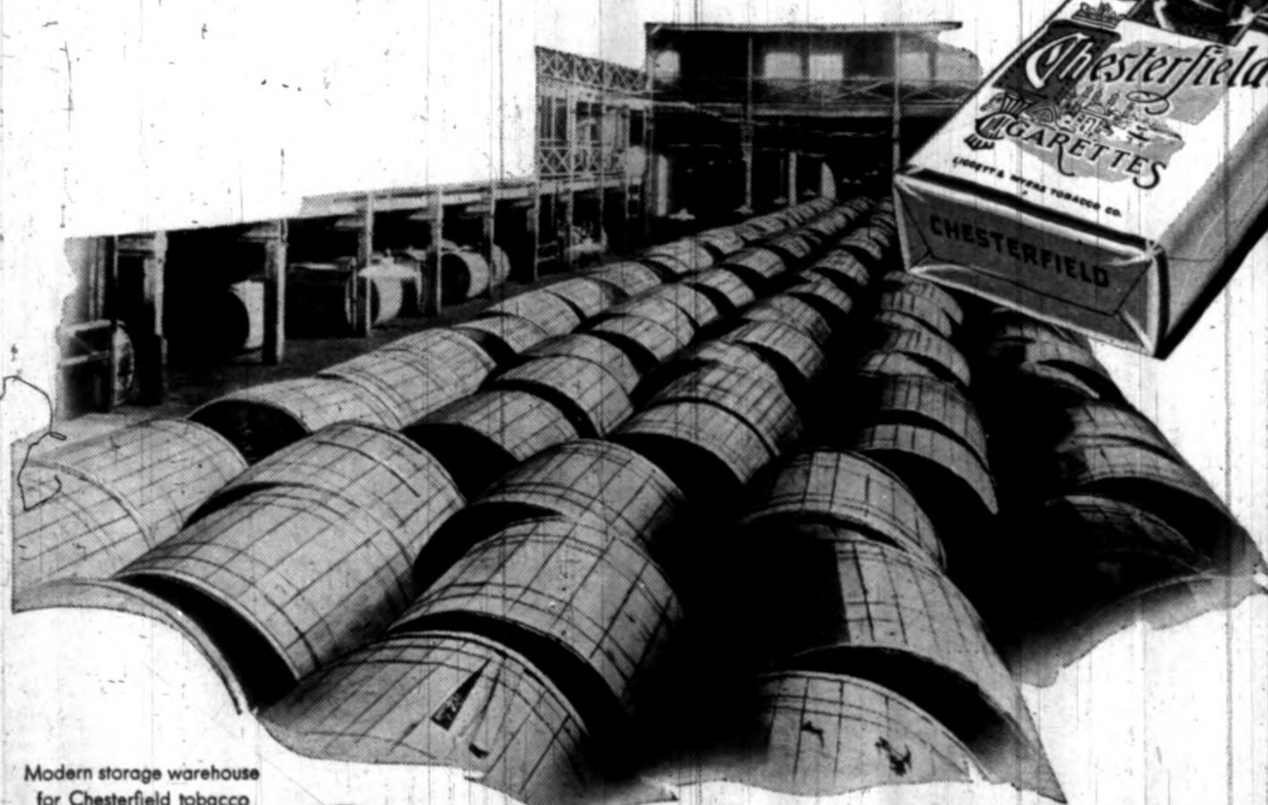
Modern storage warehouse for Chesterfield tobacco

It adds something to the Taste and makes them Milder