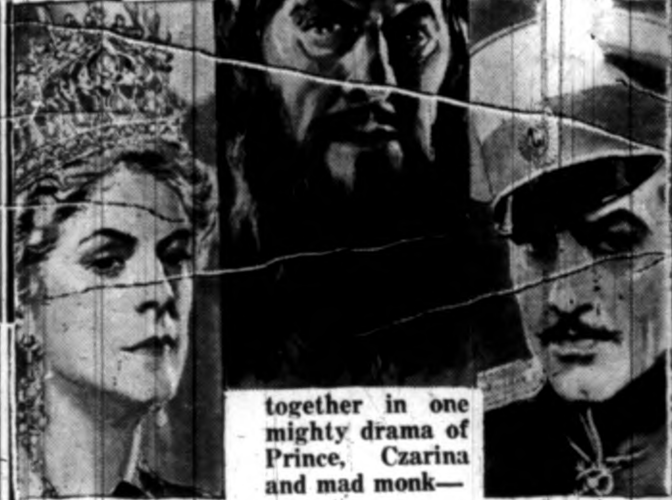
together in one mighty drama of Prince, Czarina and mad monk—

JOHN BARRYMORE ETHEL BARRYMORE LIONEL BARRYMORE