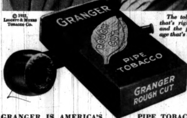
The tobacco that's right — and the package that's right