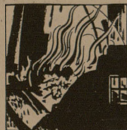
While the ashes were still smouldering, Western Electric was already in action.