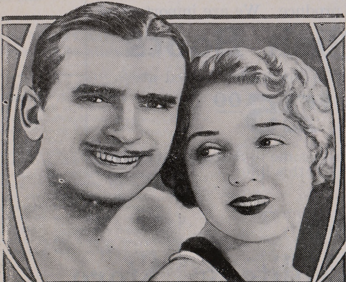
Douglas Fairbanks and Bebe Daniels in a scene from "Reaching for the Moon"