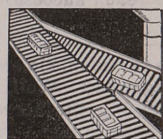
Packages can be switched onto sidings—by one central dispatcher

Sometimes the cart should be put before the horse