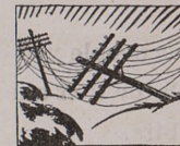
Speed needed! The emergency is met by the new warehouse

for the Bell System—purchasing its supplies—acting as its distributor.