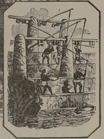
One of the early phases of Vertical Transportation

Over 75 years research and manufacturing experience are behind Otis Elevators, which are made by the same organization that has pioneered the way with every important development and major improvement in the entire field of Vertical Transportation.