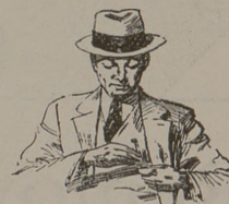
In Your Pocket