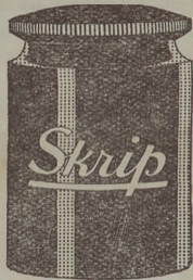
SAFETY SKRIP. Successor to ink, 50c. Refills, 3 for 25c. Practically non-breakable, can't spill. Carry it to classes!

All fountain pens are guaranteed against defects, but Sheaffer's Lifetime° is guaranteed unconditionally for your life, and other Sheaffer products are forever guaranteed against defect in materials and workmanship. Green and black Lifetime° pens, $8.75; Ladies', $7.50 and $8.25. Black and Pearl DeLuxe, $10.00; Ladies', $8.50 and $9.50. Pencils, $5.00. Others lower.