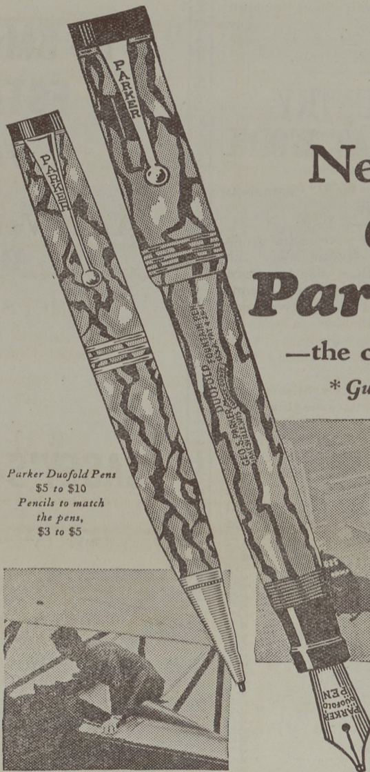
Parker Duofold Pens $5 to $10 Pencils to match the pens, $3 to $5

* Guaranteed Forever Against All Defects