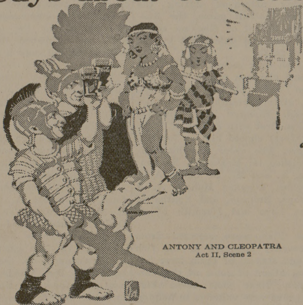
ANTONY AND CLEOPATRA Act II, Scene 2