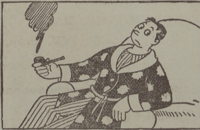
When you have a date for a hop, after working so hard at the office your feet beg you to stay at home.