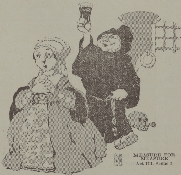
MEASURE FOR MEASURE Act III, Scene I

"The hand that hath made you fair hath made you good" ~