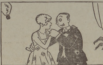
And after dancing for hours straight your Florsheims still feel cool and comfortable—man!—your whole evening is just one long happy moment!

A shoe must have the trim style to please a fellow's taste—but no man wants to sacrifice comfort, either! Solid comfort counts for so much in Florsheim shoes that for the man who has learned to insist on Florsheims, their great good looks and extra mileage is just so much velvet!