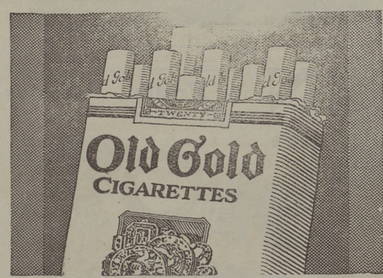
Made from the heart-leaves of the tobacco blant