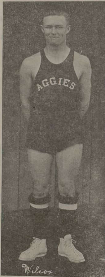
Aggie forward who starred in games with Texas and S. M. U.