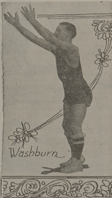
Aggie captain who lead team to victory over Longhorns to dedicate new Memorial Gymnasium.