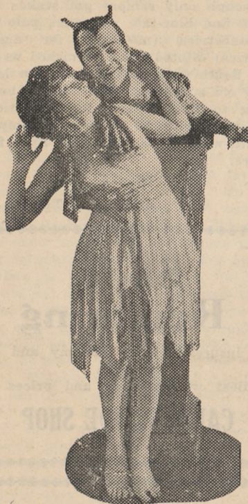
Scene from "Queen of the Moulin Rouge" A Pyramid Picture