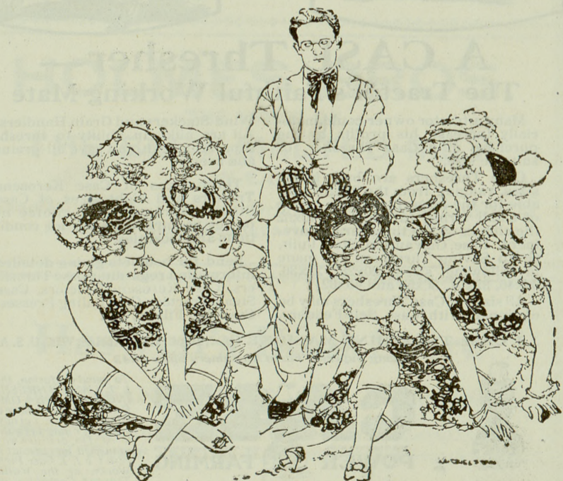
"Bumping Into Broadway," Queen Friday and Saturday